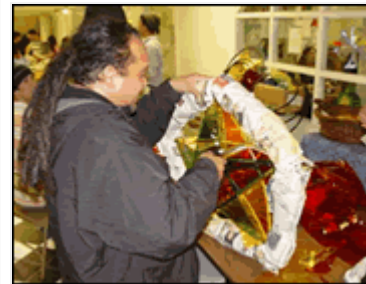
Photo: Lantern making for Parol Festival

The Festival is a shining example of Filipino culture in San Francisco - and it is in its third year in no small part due to the efforts of Bay Area LISC AmeriCorps members. Three LISC AmeriCorps members working at the Filipino American Development Foundation have been at the heart of organizing and growing these neighborhood cultural celebrations since 2003. This year the Festival promises to be bigger and better than ever, and will even have floats!