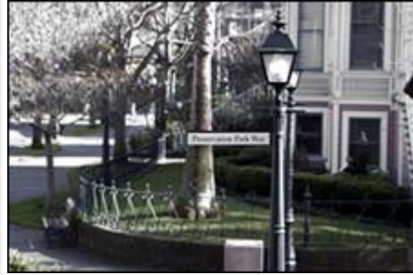
Preservation Way